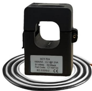
T24 – Split Core Current Transformer