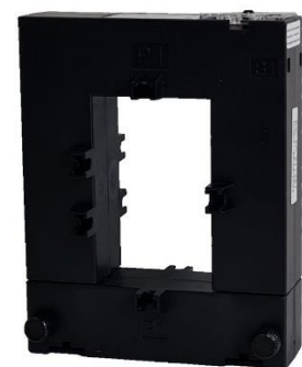
Crompton SC2 – Split Core Current Transformer

Web: www.spwales.com | Email: sales@spwales.com | Phone: 01803 295430 | Fax: 01803 212819