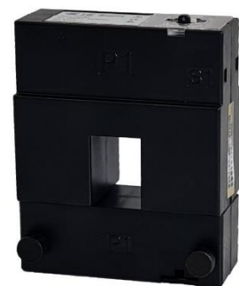
Crompton SC1 – Split Core Current Transformer

Web: www.spwales.com | Email: sales@spwales.com | Phone: 01803 295430 | Fax: 01803 212819