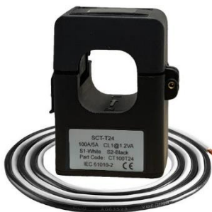
T24 – Split Core Current Transformer