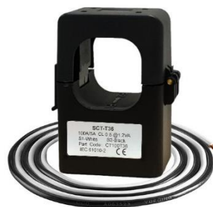
T36 – Split Core Current Transformer