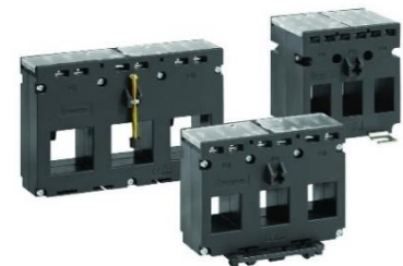
Crompton M3n1 – 3-in-1 Current Transformer

Web: www.spwales.com | Email: sales@spwales.com | Phone: 01803 295430 | Fax: 01803 212819