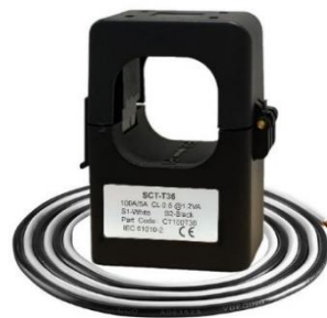
T36 – Split Core Current Transformer