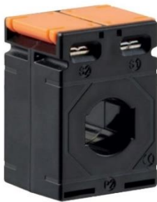
XL1B – Solid Core Current Transformer