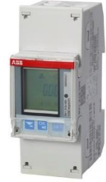
ABB B21 Steel - Summary Sheet

This entry level single phase meter in the ABB B21 range is 2 modules wide and can be mounted on DIN Rail. Supporting up to a 65 Amp load this direct connect meter is MID approved meter, making it suitable for billing applications.